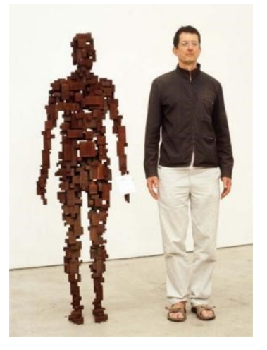
Antony Gormley 1950 - present day