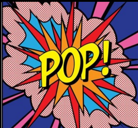
Roy Lichtenstein- Pop (1965)