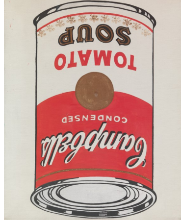
Andy Warhol, Campbell's Condensed Tomato Soup (1962)

https://artprep.weebly.com/warhol-soup-cans.html