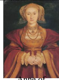
Anne of Cleves