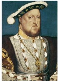
King Henry VIII