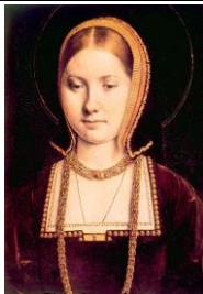
Catherine of Aragon